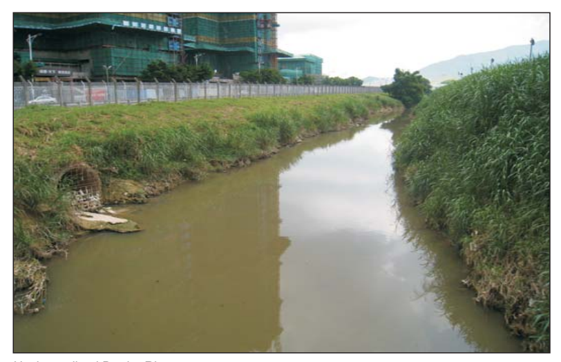
Unchannelized Border River